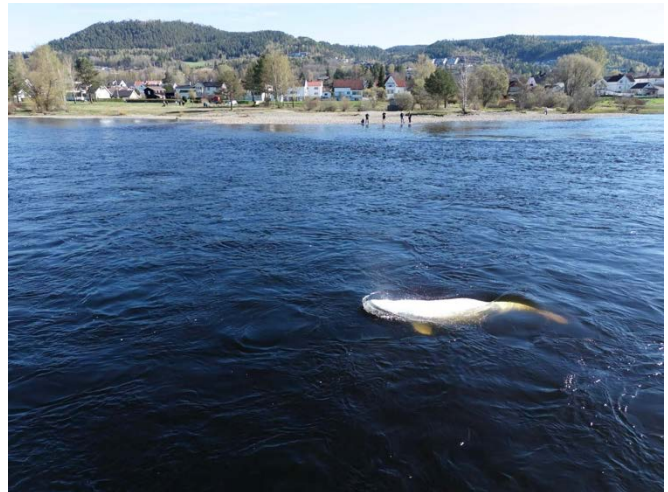
Here the beluga whale shows itself to Drammens Tidende's photographer in Hokksund.

In the meantime, marine experts warn that the animal should not be disturbed, and boats should do their best to avoid going near it. They state that if the animal becomes stressed, it runs a higher risk of getting beached and unable to get back into the water.