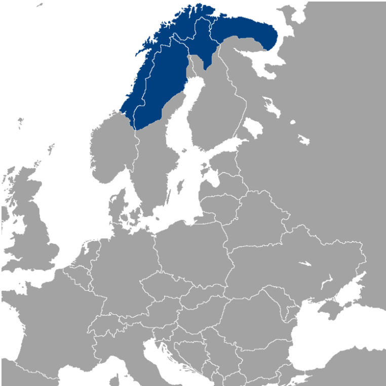
Map of the area traditionally inhabited by the Sámi people.

This presentation will reflect on the Sámi History and Traditions. We know very little about the Sámi people and this will be an interesting presentation.