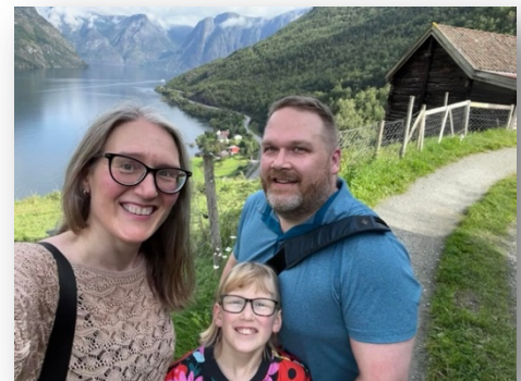
The Foro family at Otternes Farmyard near Flåm, Norway in 2023.

Happy and Randy Youngs will be serving Pizza Hot Dish for our March 11 th meeting. Side dishes will be salad, veggies & dip, garlic bread, as well as yummy treats.