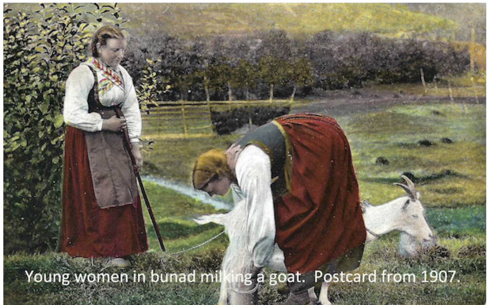
Young women in bunad milking a goat. Postcard from 1907.