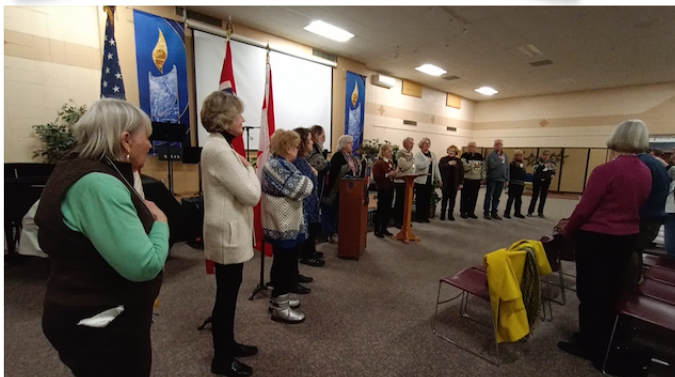
2023 Board of Directors is sworn in at the January Synnøve-Nordkap lodge meeting.