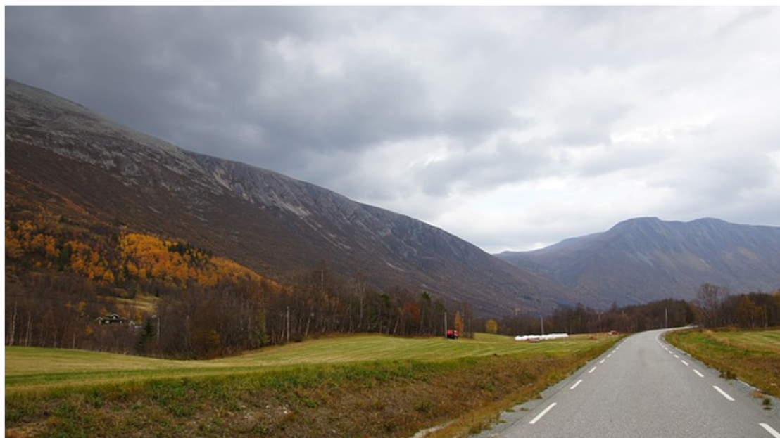
Storli Valley

Because the health and safety of all our members is our top priority, please stay home if you are not feeling well. As we are back to meeting in person at Gustavus Adolphus Lutheran Church, they strongly encourage masking within their building.