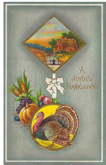
Thanksgiving card from 1910.