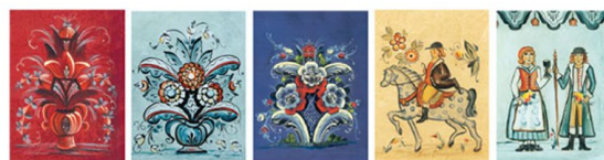
10 cards with 5 designs