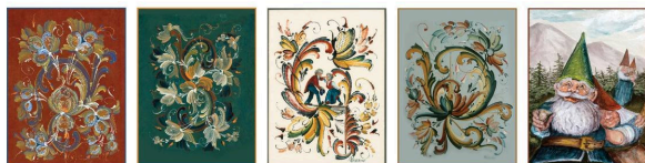
10 cards with 5 designs