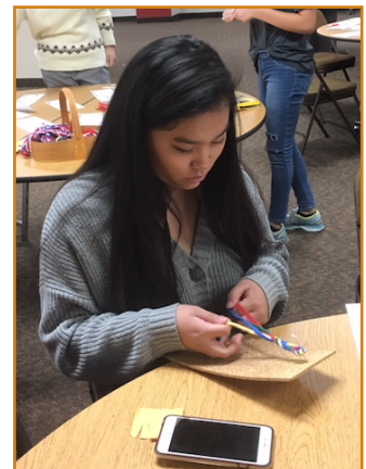
Weaving a Sami bracelet