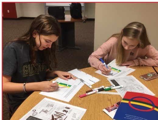
Creating a Sami flag